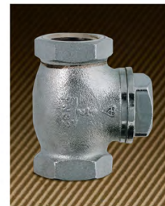
Steam Check Valve

1/2", 3/4", 1", 1 1/2" (please specify finish)