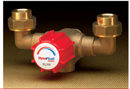
Thermostatic Hot & Cold Water Mixer