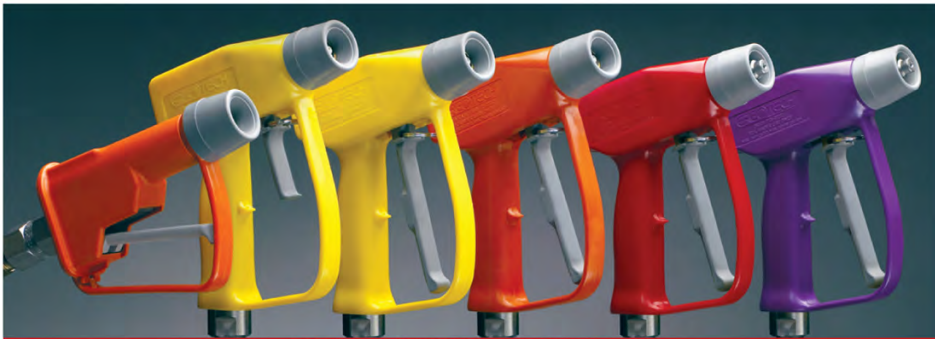
WaterBoss™ Water Nozzles