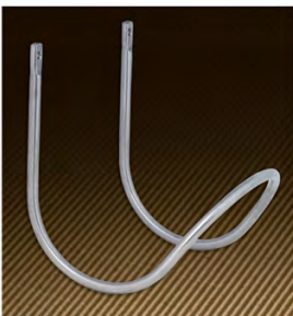
S.S. Hose Rack

All sizes (includes all mounting hardware)